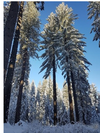
Pictures from a classic winter week in the Sierra, broadcast burning to pile burning to a winter wonderland.