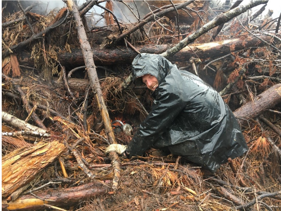
What an odd job we do!