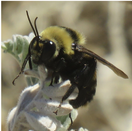
Crotch bumble bee ( Bombus crotchii )

Crotch bumble bee ( Bombus crotchii ), Franklin's bumble bee ( Bombus franklini ), Suckley cuckoo bumble bee ( Bombus suckleyi ), and western bumble bee ( Bombus occidentalis ) are no longer candidates for listing under the California Endangered Species Act (CESA) as a result of a November 2020 Sacramento Supreme Court ruling that sided with a challenge that the DFG Commission does not have the power to grant CESA protections to insects.