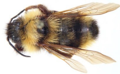
Suckley cuckoo bumble bee ( Bombus suckleyi )