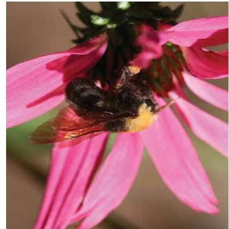
Franklin's bumble bee ( Bombus franklini )