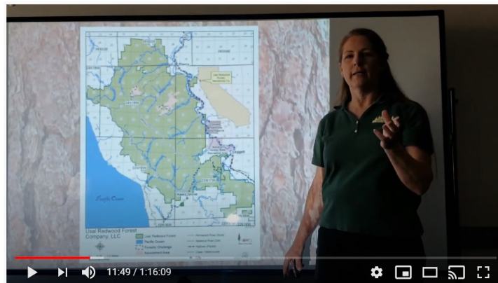
2020 Virtual Forestry Challenge Introductory Presentation

https://www.youtube.com/watch?v=vEDfu4dpels&feature=youtu.be